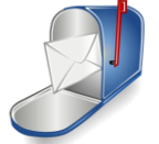
an image of a mailbox with a letter inside

Satisfaction with Special Education Services