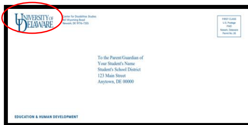
an image of an envelope with the University of Delaware letterhead

Se Inivèsite Delaware ki voye lèt sa lapòs.